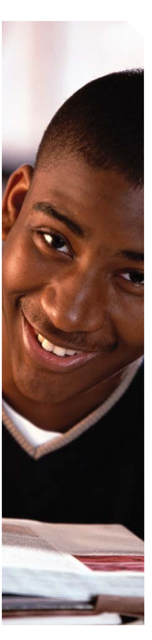
Chapter 5 Finding Help with Educational Services

The Ohio Department of Health's Sickle Cell Service Program is responsible for ensuring the availability and access to quality, comprehensive sickle cell services and promoting public awareness about this disease. For additional information, call (614) 466-1549.