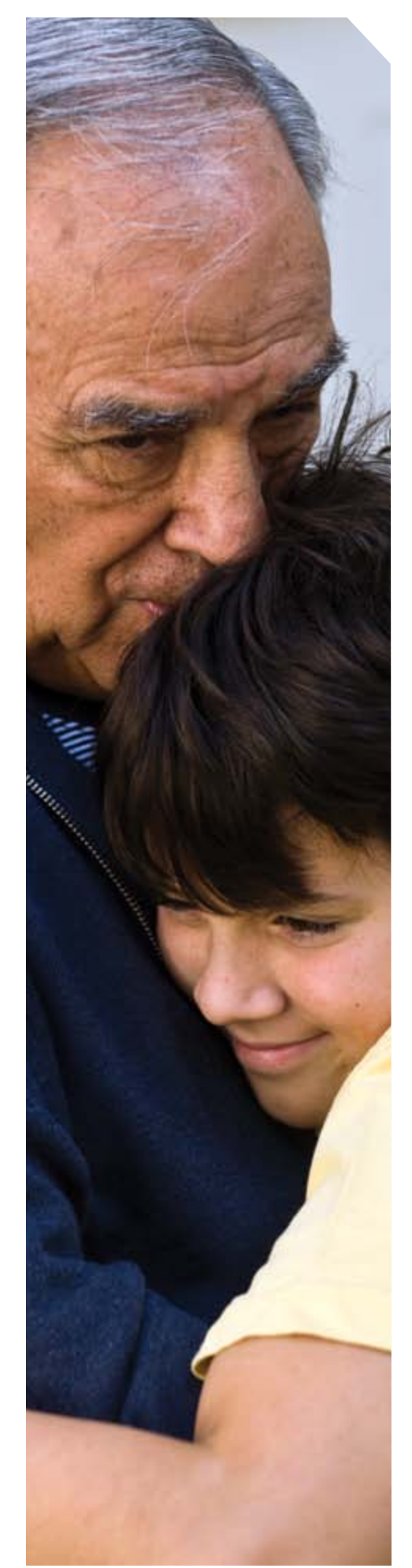
Chapter 2 Caring for Children Who Were Abused, Neglected or Abandoned