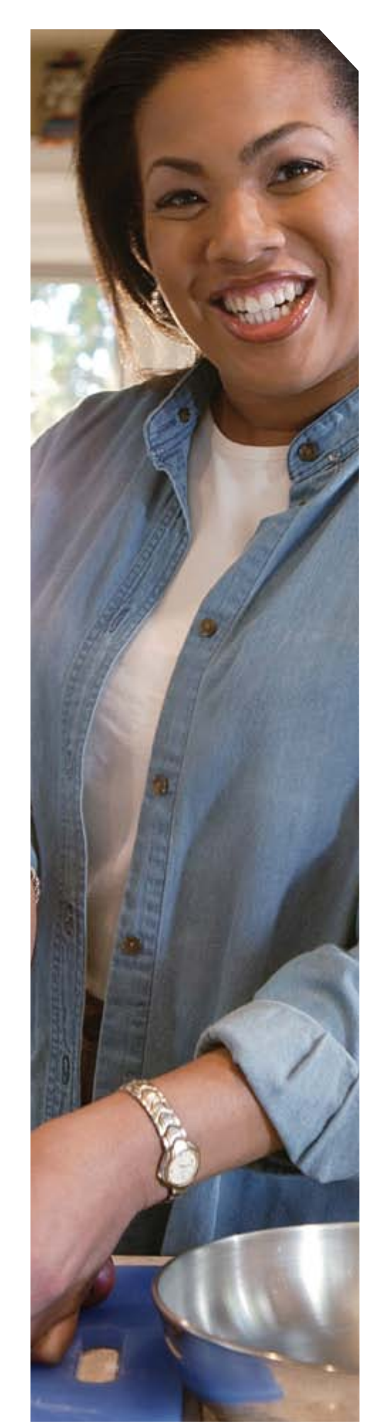
Chapter 3 Finding Help with Expenses